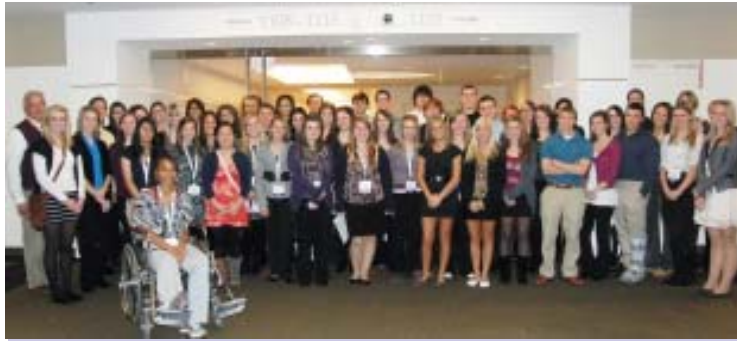
Career-minded Crystal Lake South High School (CLSHS) science students visit NUPOC.

Career-minded Crystal Lake South High School (CLSHS) science students visited NUPOC on November 29 to learn about careers in Prosthetics and Orthotics (P&O) and biomedical and rehabilitation engineering.