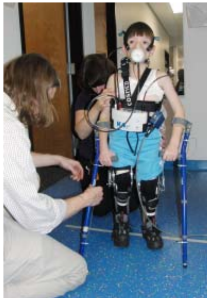
Figure 1: Subject wearing portable instrumentation for measuring gait.