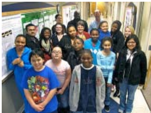
Students, teachers and mentors of the McCormick Boys and Girls Club toured NURERC and learned about prosthetics and rehabilitation engineering.